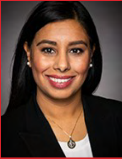
Ruby Sahota, M.P. Brampton North